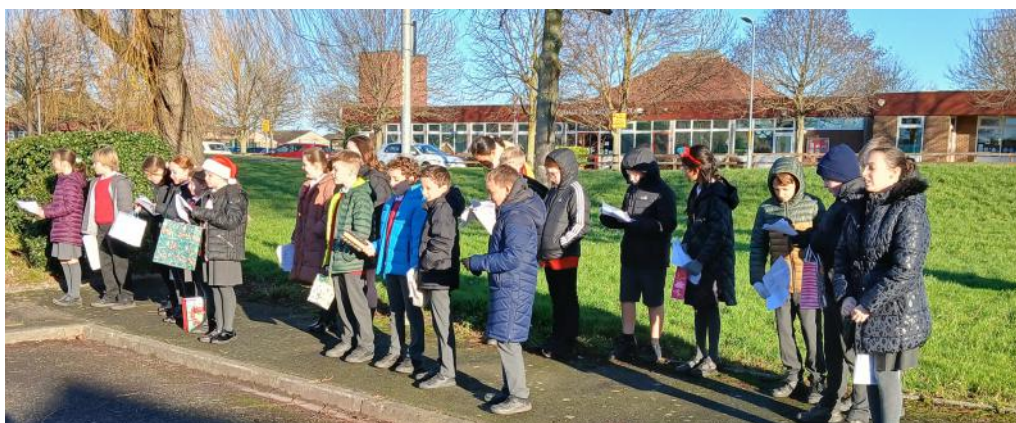
Year 5 Carol singing to neighbours on Thursday