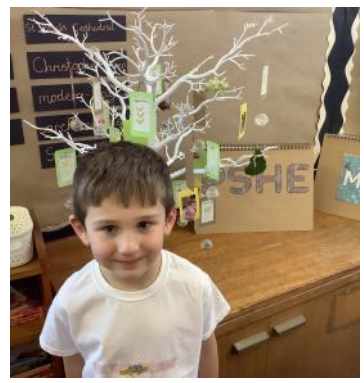
Y2 also enjoyed their visit to the mobile library bus this week and growing beans!