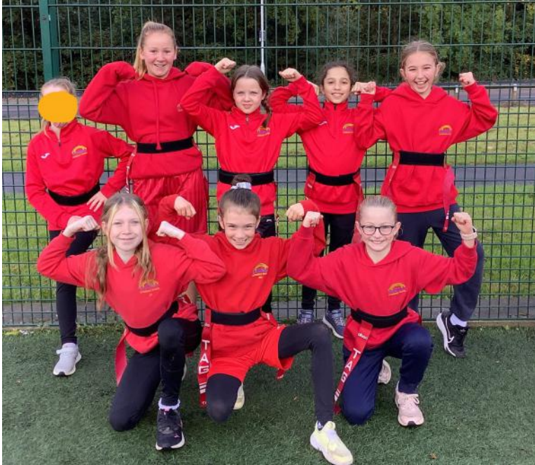
"Ready, Respectful, Safe" - Levendale Primary School