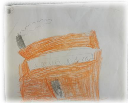
'Levendale' by Holly in Reception

I have had the pleasure of seeing so much amazing work in school over the last couple of weeks. A small selection is shown below: