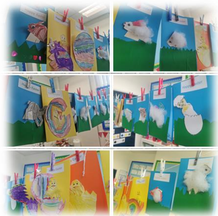
Moving Easter cards by Y1